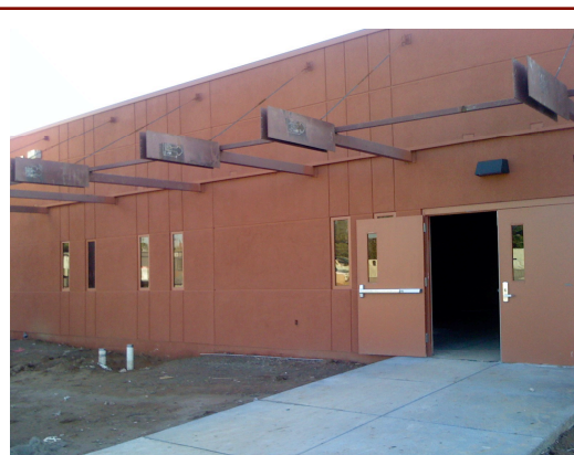
The main office entrance to Scales Technology Academy